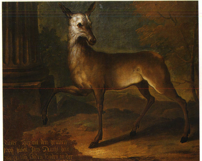
Dieses Thier auf dem grauen kopff haben die Durch die Welt von Baden Baden zu ver