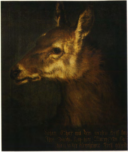
Dieses Thier mit dem besten Haff im Jahr zu machen, hat sich die Welt in der neuesten Zeit gelehrt